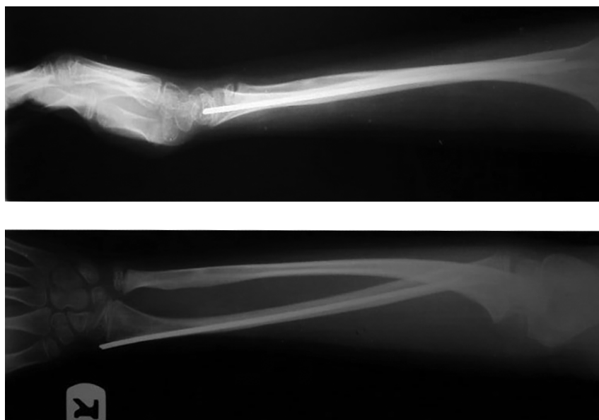
Figure 2. X-ray six months after fracture fixation represents the union in fracture site and longitudinal bone growth in the radius bone.